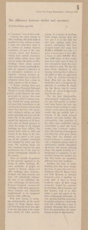
F.E. Emmons & A. Q. Jones, Presentation panels with vintage magazine clippings featuring A. Quincy Jones building designs in The Difference between Shelter and Sanctuary , Living for Young Homemakers Magazine , February 1957 issue, 1957 Vintage magazine clippings mounted on board, 30 x 40 in. (76.2 x 101.6 cm) AQUINJ004